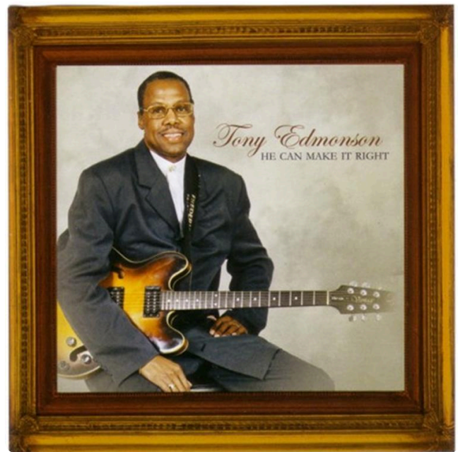
Wow, where do I begin.... You were such a big part of my life. To hear of your passing shook me...